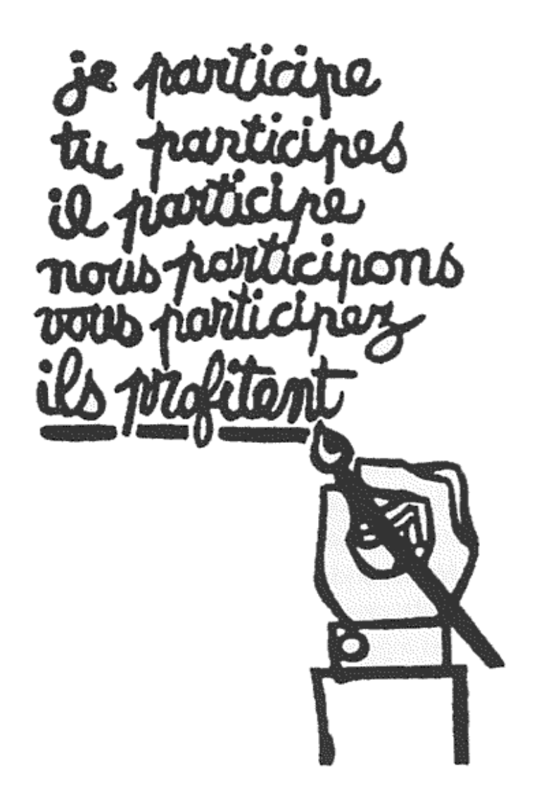
Figure 1. French student poster. In English, "I participate, youparticipate, he participates, we participate, you participate...theyprofit."

Because the question has been a bone of political contention, most of the answers have been purposely buried in innocuous euphemisms like "self-help" or "citizen